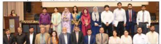
PEC کی طرف سے NUTECH میں ڈسٹریکٹ لائیکنگ تقریب کے موقع پر ٹیگ باکس